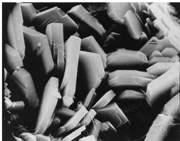
FIG. 1. Scanning electron micrograph of plates of clinoptilolite from Castle Creek, ID [Reproduced with permission from ref. 3 (Copyright 1976, The Clay Minerals Society)].

exchangers, e.g., organic resins and inorganic aluminosilicate gels (mislabelled in the trade as “zeolites”), the framework of a crystalline zeolite dictates its selectivity toward competing ions. The hydration spheres of high field-strength cations prevent their close approach to the seat of charge in the framework; hence, cations of low field strength are generally more tightly held and selectively exchanged by the zeolite than other ions. Clinoptilolite has a relatively small CEC ( \approx 2.25 meq/g), but its cation selectivity is