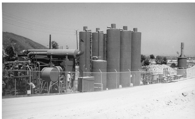
FIG. 5. Methane-purification pressure-swing adsorption unit, NRG Company, Palos Verde Landfill, Los Angeles, CA.

Drinking Water. In the late 1970s, a 1-MGD (million gallons per day) water-reuse process that used clinoptilolite cation-exchange columns went on stream in Denver, CO, (Fig. 4) and brought the \text{NH}_4^+ content of sewage effluent down to potable standards ( <1 ppm; refs. 20–22). Based on Sims and coworkers' (23, 24) earlier finding that nitrification of sewage sludge was enhanced by the presence of clinoptilolite, a clinoptilolite-amended slow-sand filtration process for drinking water for the city of Logan, UT, was evaluated. By adding a layer of crushed zeolite, the filtration rate tripled, with no deleterious effects. At Buki Island, upstream from Budapest, clinoptilolite filtration reduced the \text{NH}_3 content of drinking water from 15–22 ppm to <2 ppm (25, 26). Clinoptilolite beds are used regularly to upgrade river water to potable standards at Ryazan and other localities in Russia and at Uzhgorod, Ukraine (27, 28).