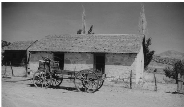
FIG. 3. Abandoned ranch house in Jersey Valley, NV, constructed of quarried blocks of erionite-rich tuff.

Municipal Wastewater. Large-scale cation-exchange processes using natural zeolites were first developed by Ames (1) and Mercer et al. (2), who demonstrated the effectiveness of