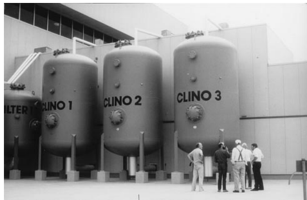
FIG. 4. Clinoptilolite-filled columns at a Denver, CO, water-purification plant [Reproduced with permission from ref. 106 (Copyright 1997, AIMAT)].

clinoptilolite for extracting \text{NH}_4^+ from municipal and agricultural waste streams. The clinoptilolite exchange process at the Tahoe-Truckee (Truckee, CA) sewage treatment plant removes >97\% of the \text{NH}_4^+ from tertiary effluent (15). Hundreds of papers have dealt with wastewater treatment by natural zeolites. Adding powdered clinoptilolite to sewage before aeration increased \text{O}_2 -consumption and sedimentation, resulting in a sludge that can be more easily dewatered and, hence, used as a fertilizer (16). Nitrification of sludge is accelerated by the use of clinoptilolite, which selectively exchanges \text{NH}_4^+ from wastewater and provides an ideal growth medium for nitrifying bacteria, which then oxidize \text{NH}_4^+ to nitrate (17–19). Liberti et al. (19) described a nutrient-removal process called RIM-NUT that uses the selective exchange by clinoptilolite and an organic resin to remove \text{N}_2 and P from sewage effluent.