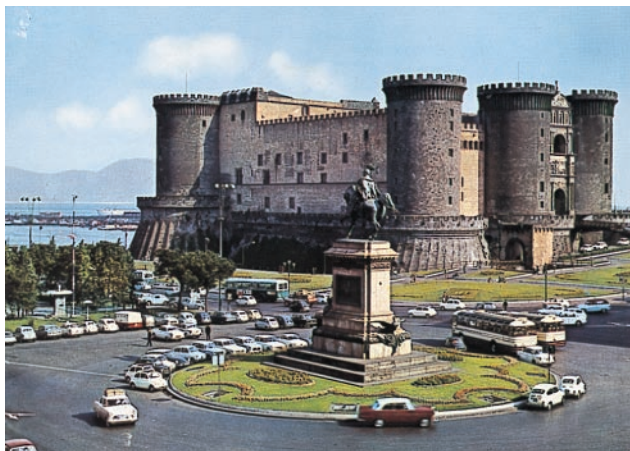
FIG. 2. Castel Nuovo (Naples, Italy) constructed of tuffo giallo napolitano [Reproduced with permission from ref. 105 (Copyright 1995, International Committee on Natural Zeolites)].

materials have been used in cement production throughout Europe. The high silica content of the zeolites neutralizes excess lime produced by setting concrete, much like finely powdered pumice or fly ash. In the U.S., nearly $1 million was saved in 1912 during the construction of the 240-mile-long Los Angeles aqueduct by replacing \leq 25\% of the required portland cement with an inexpensive clinoptilolite-rich tuff mined near Tehachapi, CA (8, 9).