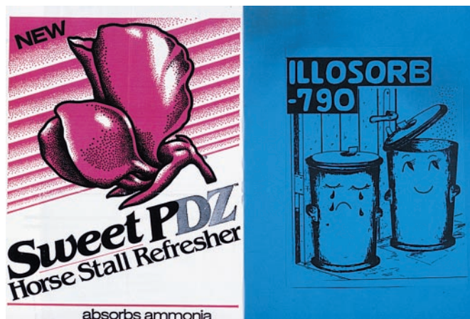
FIG. 9. Footwear and garbage-can zeolite deodorization products [Reproduced with permission from ref. 106 (Copyright 1997, AIMAT)].

Animal-Waste Treatment. Natural zeolites are potentially capable of (i) reducing the malodor and increasing the nitrogen retentivity of animal wastes, (ii) controlling the moisture content for ease of handling of excrement, and (iii) purifying the methane gas produced by the anaerobic digestion of manure. Several hundred tonnes of clinoptilolite is used each year in Japanese chicken houses; it is either mixed with the droppings or packed in boxes suspended from the ceilings (K. Torii, unpublished work). A zeolite-filled air scrubber was used to improve poultry-house environments by extracting NH_3 from the air without the loss of heat that accompanies ventilation in colder weather (93). Granular clinoptilolite added to a cattle feedlot ( 2.44 \text{ kg/m}^2 ) significantly reduced NH_3 evolution and odor compared with untreated areas (94). As more and more animals and poultry are raised close to the markets to reduce transportation costs, the need to decrease