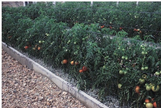
FIG. 6. Tomatoes grown zeoponically in Havana, Cuba [Reproduced with permission from ref. 106 (Copyright 1997, AIMAT)].

These reactions await serious physiological and biochemical examination.