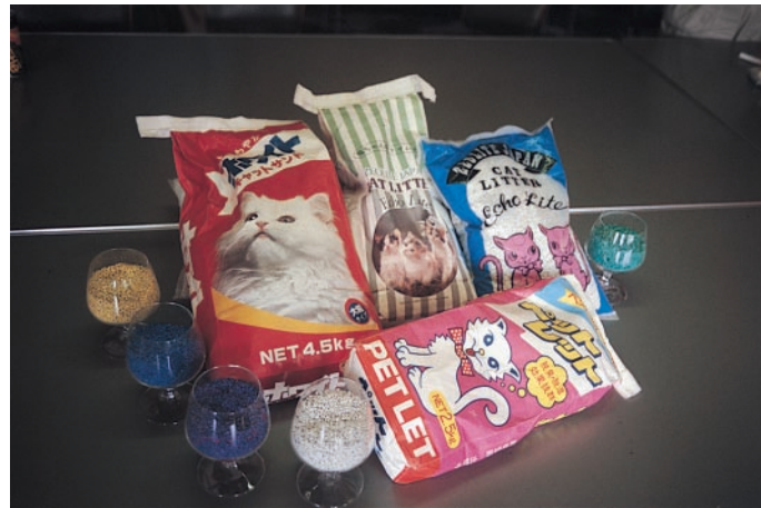
FIG. 8. Zeolite deodorization products from Itaya, Japan [Reproduced with permission from ref. 106 (Copyright 1997, AIMAT)].

ingly soluble phosphate minerals (e.g., apatite; refs. 80 and 81). The small amount of Ca in the soil solution in equilibrium with the apatite exchanges onto the zeolite, thereby disturbing the equilibrium and forcing more Ca into solution. The apatite is ultimately destroyed, releasing P to the solution, and the zeolite gives up its exchanged cations (e.g., K^+ or NH_4^+ ). Taking the zeolite-apatite reaction one step further, the National Aeronautics and Space Administration prepared a substrate consisting of a specially cation-exchanged clinoptilolite and a synthetic apatite containing essential trace nutrients for use as a plant-growth medium in Shuttle flights (Fig. 7). This formulation may well be the preferred substrate for vegetable production aboard all future space missions (82) and in commercial green houses.